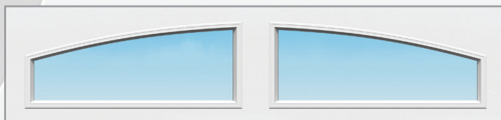
Two Piece Arched