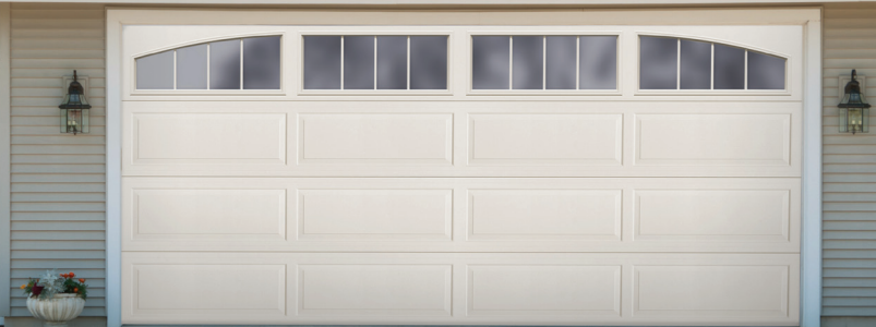
AP200LV Almond Ranch with Mission Vista Windows