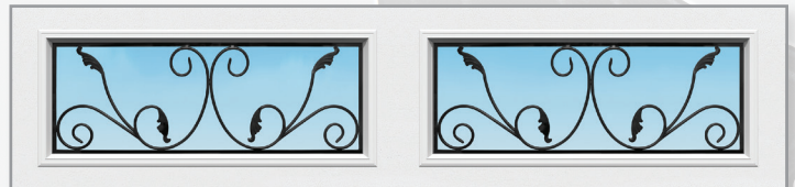
Wrought Iron - Square