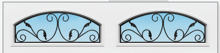
Wrought Iron - Arched