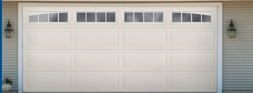
AP200 Almond Ranch with Breckenridge Windows