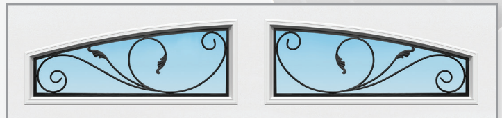
Wrought Iron - Two Piece Arched