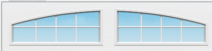
4-Over-4 - Two Piece Arched