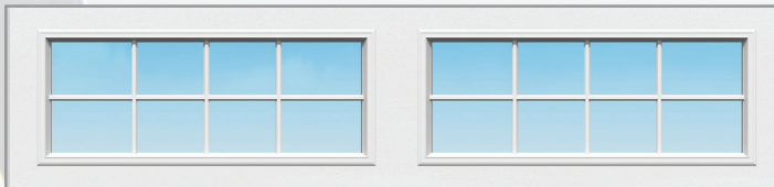
4-Over-4 - Square