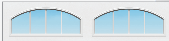
4 Pane - Arched