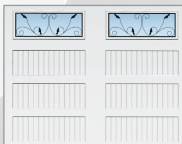
Recessed Ranch Carriage House Grooved