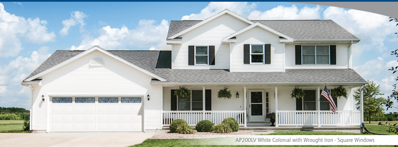
AP200LV White Colonial with Wrought Iron - Square Windows