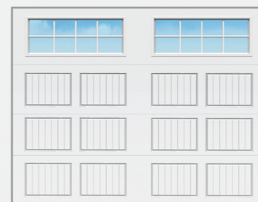
Recessed Colonial Carriage House Grooved

Max door size: 18'2" wide x 10' high (available in 1/8" door width increments)