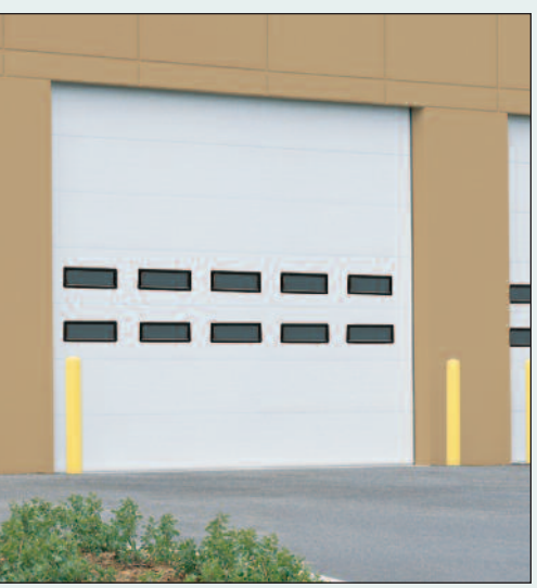
ThermaSeal TM175, white, with rectangular windows

Rust-resistant galvanized steel is finished with a two-coat, baked-on paint process for long life. The superior thermal bond between steel and polyurethane foam is warranted against delamination for 10 years.